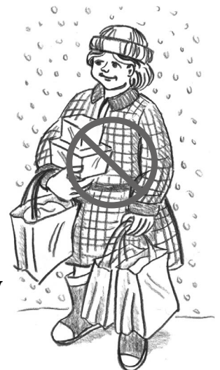
Keep hands free