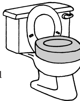
Raised (elevated) toilet seat

If the mobile person is missing the toilet, get a toilet seat in a color that is different from the floor color. This may help him see the toilet better. If the person with AD fails to remember to wipe himself or wash his hands, you will have to prompt him to do it, help him to do it, or do it for him.